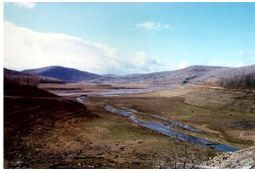
River basin are much more complex.