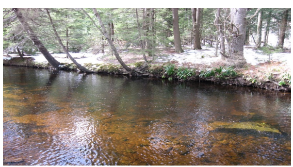
Tunkhannock Creek Watershed Conservancy, Brodh ronmental protection groups of Pennsylvania, New York, New Jersey, and Delaware.

clean it once it is contaminated. So to answer the original question: